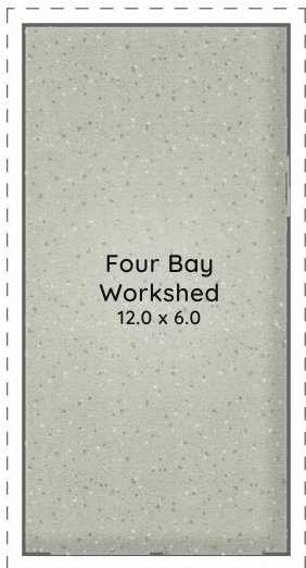
:: FLOOR PLAN (Not Actual Location)