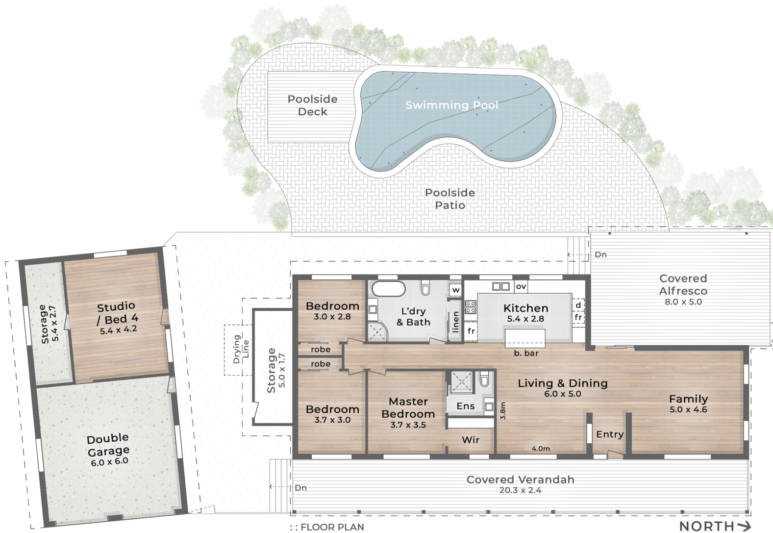
:: FLOOR PLAN