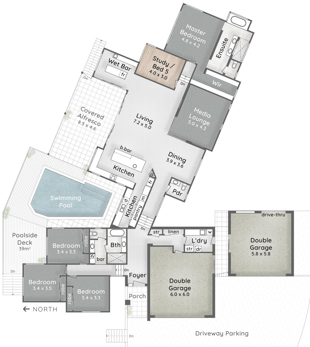
:: FLOOR PLAN 2.7m Ceiling