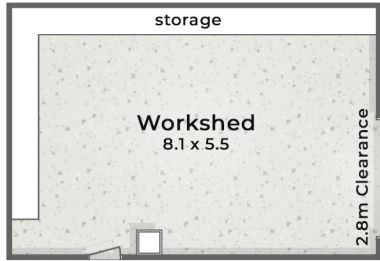
:: FLOOR PLAN (Not Actual Location)