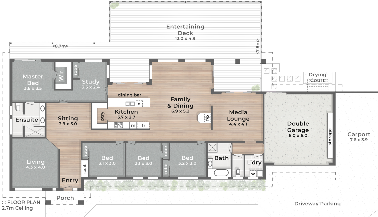
:: FLOOR PLAN 2.7m Ceiling