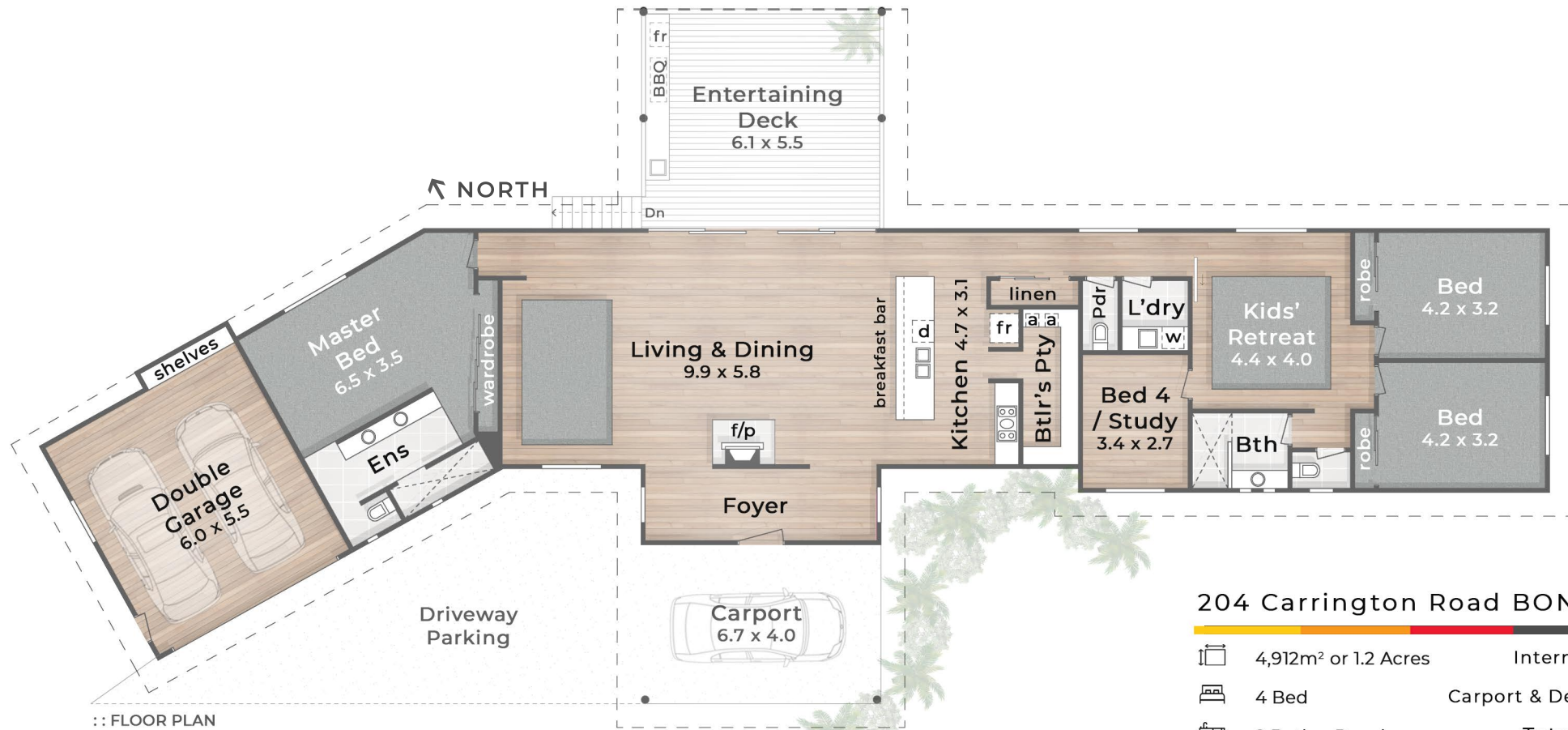
:: FLOOR PLAN Ceiling up to 3.7m