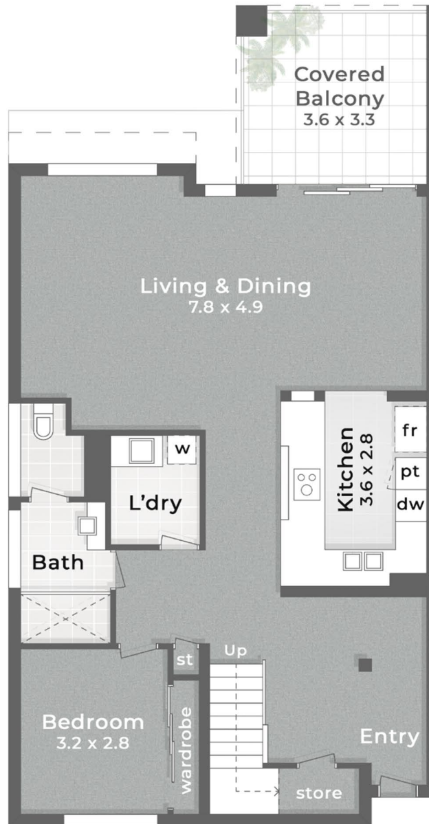
:: FLOOR PLAN Level 2 - 2.7m Ceiling