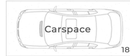
:: ALLOCATED PARKING (Not Actual Location)